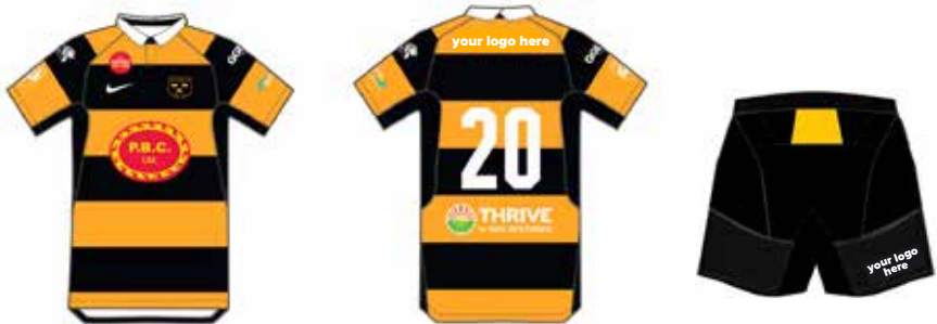
Example of various sponsorship options on jerseys and shorts for company logo on Young Munster Kit