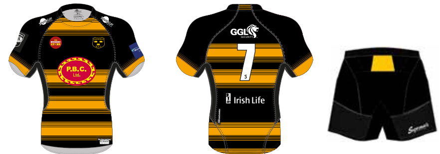
Example of various sponsorship options on jerseys and shorts for company logo on Young Munster Kit